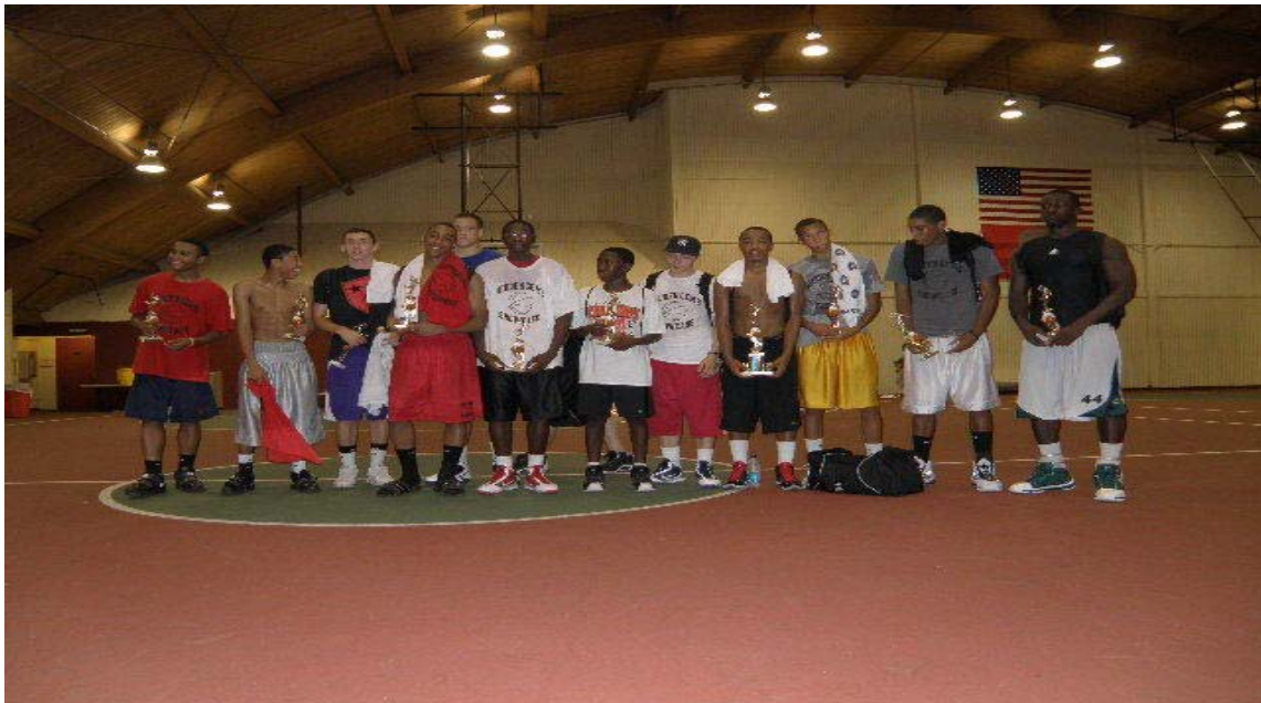
2010 All-Tournament Team